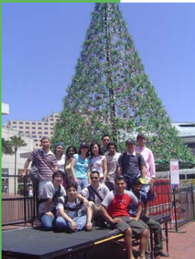
Christmas Tree in Darling Harbour

Here's the Australian version of Jingle Bells.